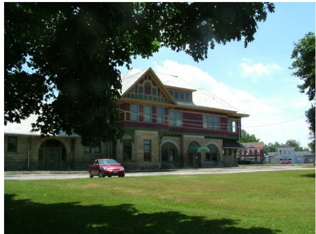
Restored Galion train station

Galion participants also stressed the role rail can play in attracting tourism and revitalizing its historic downtown as well as other small towns along the proposed line. Galion has already secured over $1 million in state funds to restore its historic rail depot. Meeting participants were interested in seeking economic impact data on small towns along the proposed rail corridors, as well as more analysis on the benefits of moving more freight by rail.