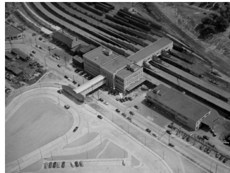
Toledo Union Station, 1954

MDOT officials at the meeting expressed support for making the Cleveland-Columbus-Cincinnati route the first priority, but reiterated their interest in the Toledo-Detroit passenger rail segment. They referenced a study on commuter rail from Detroit to Ann Arbor that would use some of the proposed Ohio Hub rail corridor, saying it would be a good source of information. TMACOG staff suggested that providing maintenance on the freight rail right-of-way may qualify the project for tax credits. TMACOG also offered to write a resolution in support of the Ohio Hub, and to coordinate efforts to communicate the plan's benefits with northwest Ohio elected officials.