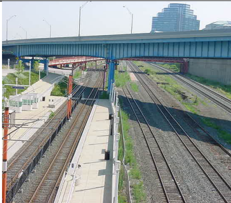
Local light rail, Amtrak passenger rail and interstate freight railroad tracks share a rail corridor in Cleveland, similar to proposed service in Central Ohio